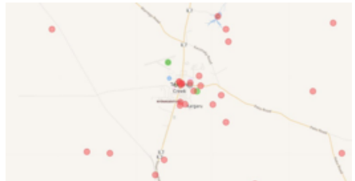
WikiShootme Tennant Creek before

WikiClub NT meets to create and update Wikipedia pages about NT people, places and histories. Coordinator Caddie Brain headed to Tennant Creek recently, where there were only 20 images the town on Wikipedia/Wikimedia Commons. Using the new Wikidata tool, WikiShootme , it is possible to see where there were known areas of interest but no images - the red dots. Following the workshop, the map turned from red to green. Four new pages were created and 35 new images were uploaded for all to use.